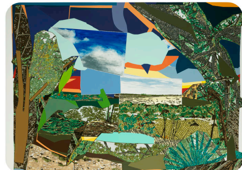
Mickalene Thomas, Hudson River On My Mind , 2009

Lehmann Maupin is pleased to announce its participation in Art Basel Miami Beach 2009, 3 - 6 December 2009. The gallery will present a selection of works by Tracey Emin, Tim Rollins and K.O.S., Mickalene Thomas and will feature special installations by Teresita Fernández and new Lehmann Maupin artist, Nari Ward .