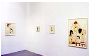
Installation shot of Tracey Nakayama's watercolors at P.S. 1