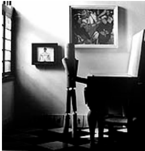
Joshua Stern Untitled (Figure at Virginal) 2003 Parker's Box

turned into dramas of yuppie angst. In Untitled (Figure at Virginal) , a lone figure stands in for the pretty pianist from Vermeer's The Concert . In another Untitled (Figure Seated at Table) , The Lady Writing a Letter with her Maid is replaced by a mopping stickman, who remorsefully holds the undefined top of his cylinder head against one unformed arm.