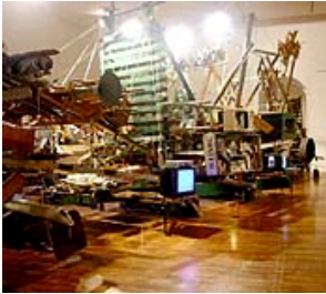
Dieter Roth Garden Sculpture 1968-92 P.S. 1

Recess prevails at the converted Queens schoolhouse that is the P.S.1 Art Center , currently filled with the Fluxus high jinks of German artist Dieter Roth (1930-98). While the larger part of the Roth retrospective is on view at MoMA QNS [see " Loosening Up: Dieter Roth's Tragedy " by Donald Kuspit ], P.S.1 is exhibiting several oversized works, some that represent accumulations maintained over many years.