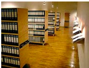
Dieter Roth Flat Garbage 1975-76/1999