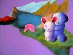
Mie Yim Puppet Bunny 2004