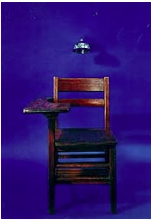
Ilyse Soutine Desk and Showerhead 2002 Miller/Geisler