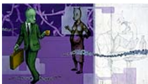
Kojo Griffin Untitled (#2) 2004 Mitchell-Innes & Nash

Yim's smaller canvases and works on paper, which range in price from $650 to $3,950, show more of the creepy practices stuffed animals might engage in once the lights are off and the kids are asleep.