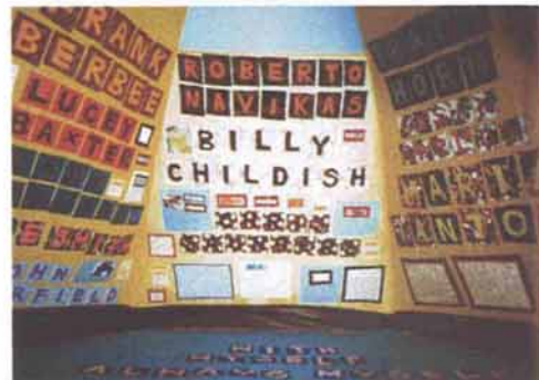
Above: Tracey Emin's Everyone I Have Ever Slept With 1963-1995 , a tent adorned with names including that of Billy Childish.