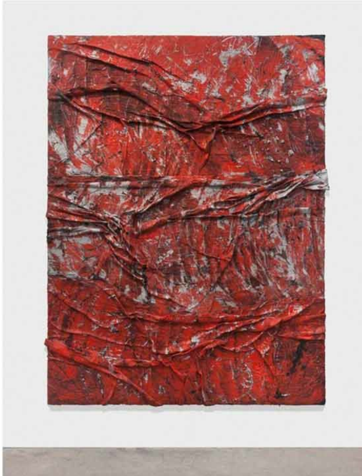
Angel Otero Untitled ("SK-MV") , 2013