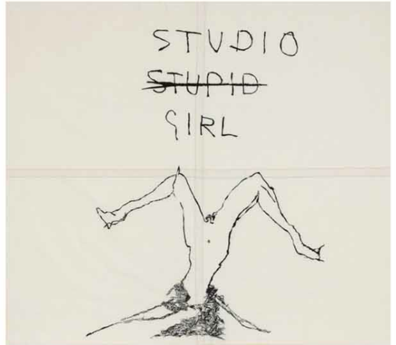
Tracey Emin Stupid Studio Girl , 2011