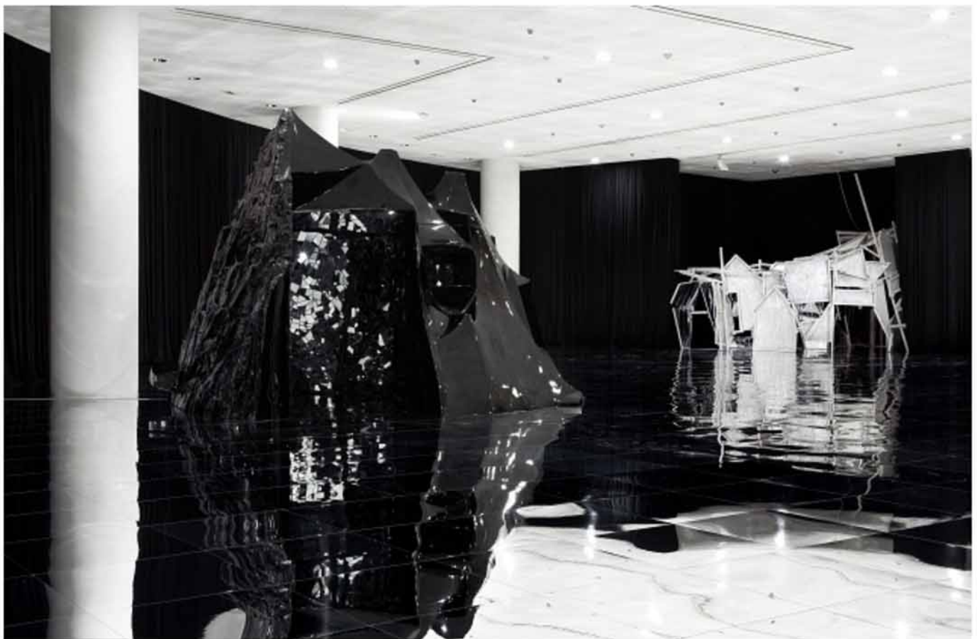
Bunker (M. Bakhtin), 2007/2012 + Souterrain, 2012