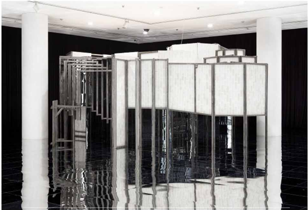
Via Negativa 2012